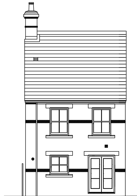
REAR ELEVATION (EAST)