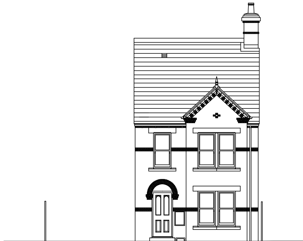
FRONT ELEVATION (WEST)